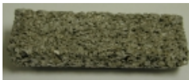
Free body sintered aluminum flakes.