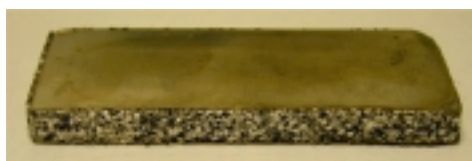
Laminate structure of aluminum face sheets and porous aluminum core.